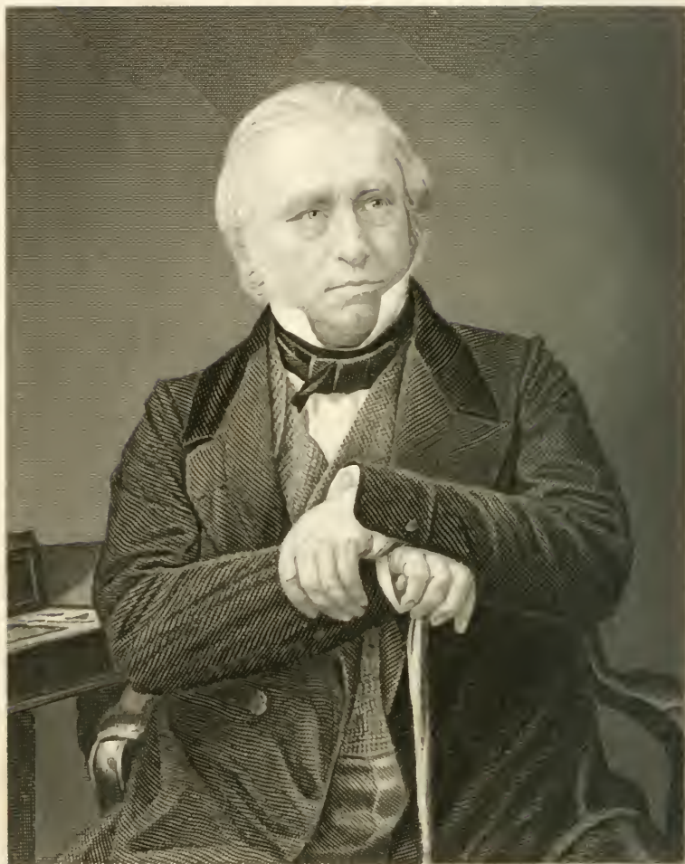
Portrait of John Ruskin by Charles